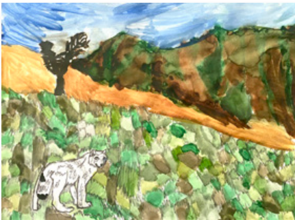
“Wolf in the Lamar Valley”